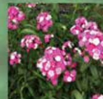
Dianthus Amazon Rose Magic