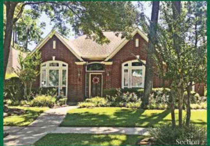
9007 Rhapsody Lane