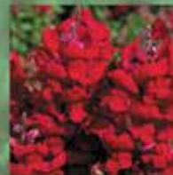
Snapdragon Montego Red