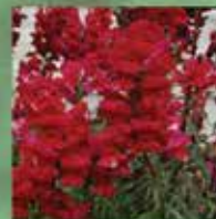
Snapdragon Sonnet Crimson