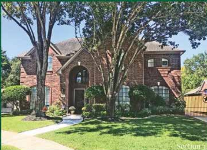
7611 Crescendo Court