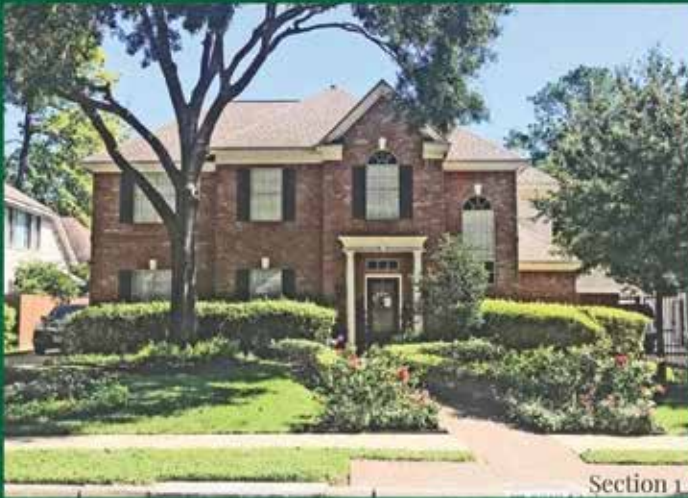
8010 Sonata Court