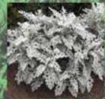
Dusty Miller Silver Dust