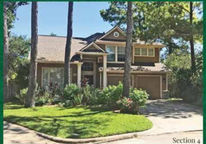
9503 Musical Court