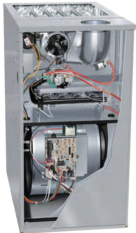
N80 Gas Furnace

Tempstar gas furnaces are designed for durability and comfort. The warmth and efficiency of natural gas combined with a quiet, efficient blower motor delivers comfort throughout the cold seasons. The gas furnace can also be combined with an indoor evaporator coil and properly matched outdoor air conditioner or heat pump to provide cooling during the warm seasons.