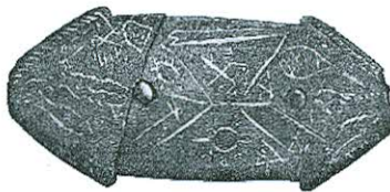
Hieroglyphic and Story Telling Tools