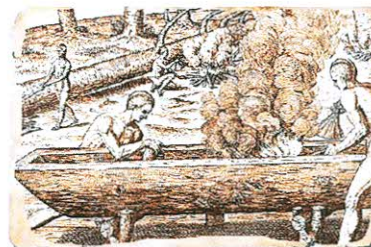
Tools of Transportation