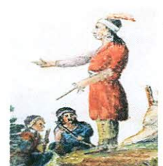
Tools for Governing