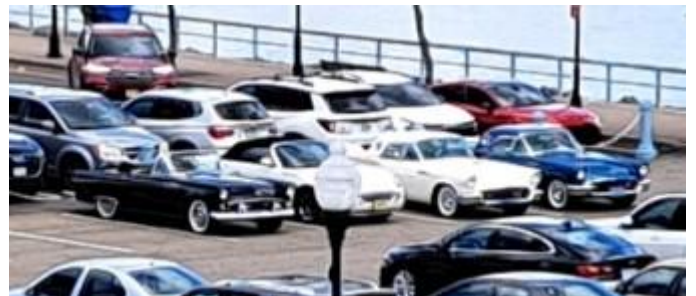
Sorry for the fuzzy pic - long shot