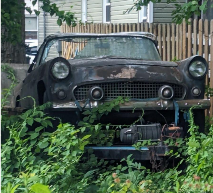
Gene sent this pic of another fixer upper. Trailer included.