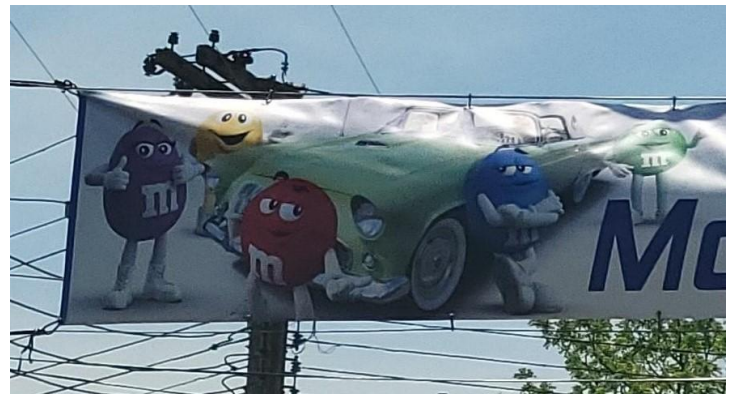
was featured on a poster for a local show