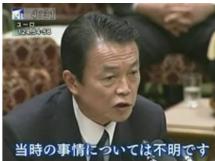
Prime Minister Aso telling the Diet he knew nothing about POWs at an Aso family coal mine until December 2008 (Tokyo Broadcasting System, March 9, 2009)

The Foreign Ministry, in its February 27 written response to my written question, stated that the Japanese Embassy and Consulate General in Australia did inform the Ministry in Tokyo of these news stories by official cable. But Prime Minister Aso, who was foreign minister at that time, answered my question during the House of Councillors' Budget Committee meeting on March 9 by saying, "I have absolutely no recollection of receiving such a report."