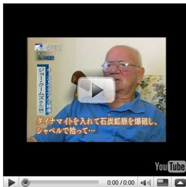
Segment on POWs at Aso Mining from Tokyo Broadcasting System’s News Bird television program, March 9, 2009 (source of images used in this article)

The more I listened to such stories told at the actual location, the more I realized that it was impossible for Prime Minister Aso, the Foreign Ministry, and people connected with the Aso Group not to have known about the existence of the POWs. Were they forced into their continuous denials because they already knew about the POWs due to the previously mentioned media reports, records presented by researchers, and testimonies of the prisoners themselves? Indeed, the survivors among the “300 POWs who were erased by Aso Mining for 64 years” were appearing before us like phantoms.