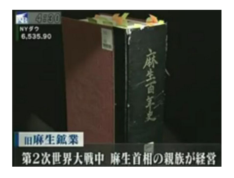
Published by Aso Taro in 1975, The 100-Year History of Aso does not mention the company's POW workforce

"We had several falls at the coal mine. Some of them were quite big, but fortunately no one was seriously injured. The camp itself consisted of new buildings. But the situation in the mine was terrible. It took us half an hour to walk down for around one mile from the entrance to the coal face. We worked in two shifts for twelve hours a day. I was around 80 kilograms but towards the end of the war my weight was down to around 48 kilograms. I'm ready to receive any kind of compensation from the Japanese government."