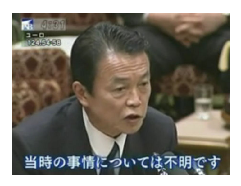
Prime Minister Aso telling the Diet he knew nothing about POWs at an Aso family coal mine until December 2008 (Tokyo Broadcasting System, March 9, 2009)

The Foreign Ministry, in its February 27 written response to my written question, stated that the Japanese Embassy and Consulate General in Australia did inform the Ministry in Tokyo of these news stories by official cable. But Prime Minster Aso, who was foreign minister at that time, answered my question during the House of Councillors' Budget Committee meeting on March 9 by saying, "I have absolutely no recollection of receiving such a report."