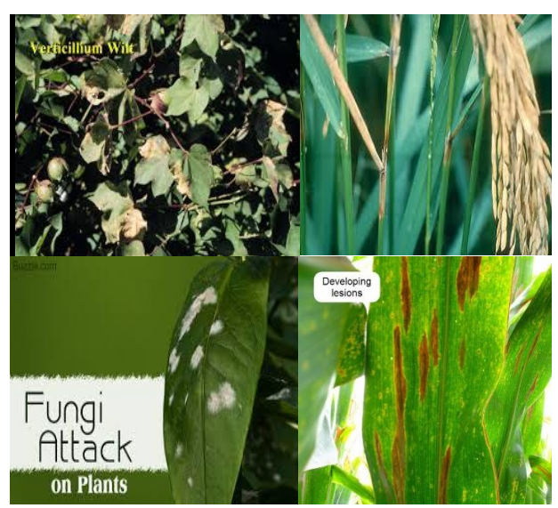
Fig.2 Diseases in Plants [13, 14, and 15]

ISSN: 2393-9028 (PRINT) | ISSN: 2348-2281 (ONLINE)