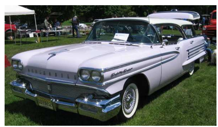
Franklin Lakes - remember purple (lilac) 98 Olds's?