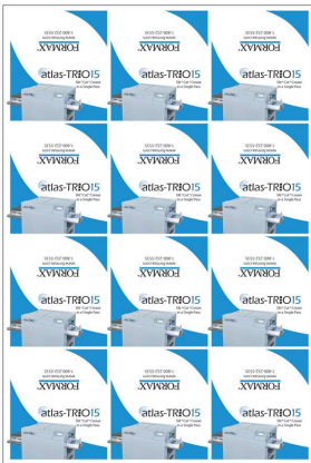
12-up half-fold business cards on 12" x 18" sheet