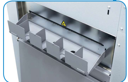
Business card catch tray