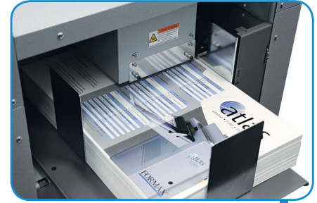
Upper-belt tri-suction feed system for accurate feeding of large & heavy stocks