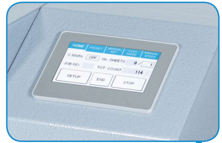
Color touchscreen control panel

11" x 17" Sheet: 4-up postcard, single crease ledger