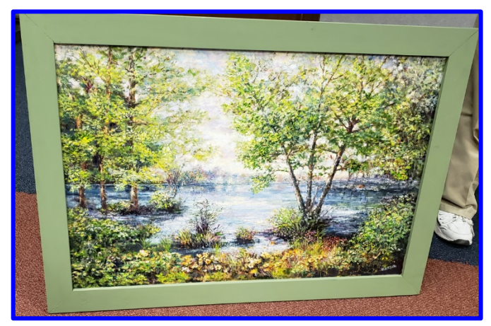
1<sup>st</sup> Place: Untitled Landscape by Jerry Hosten (Oil)