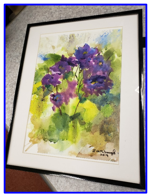
2<sup>nd</sup> Place: African Violet by Jim McDonough (Watercolor)