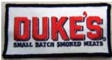
Marrowed Edge Patch