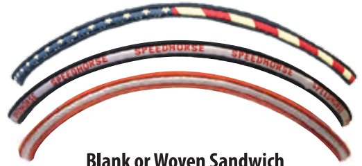
Blank or Woven Sandwich (Used to add Flag, Text or Custom Color)