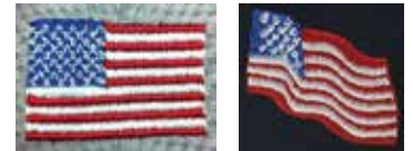
American Flag (Flat & Wavy)