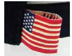
*Woven Folded Tag