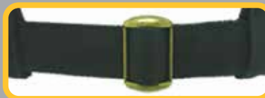
Antique Brass (or Silver) Self-Slide *Additional charges apply