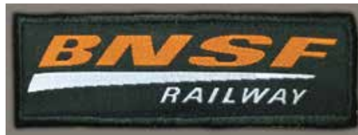
*Woven Label with Satin Stitch Edge