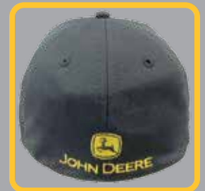
Fitted Back *MOQ 144 per size Available in S/M, M/L & L/XL *Additional charges apply