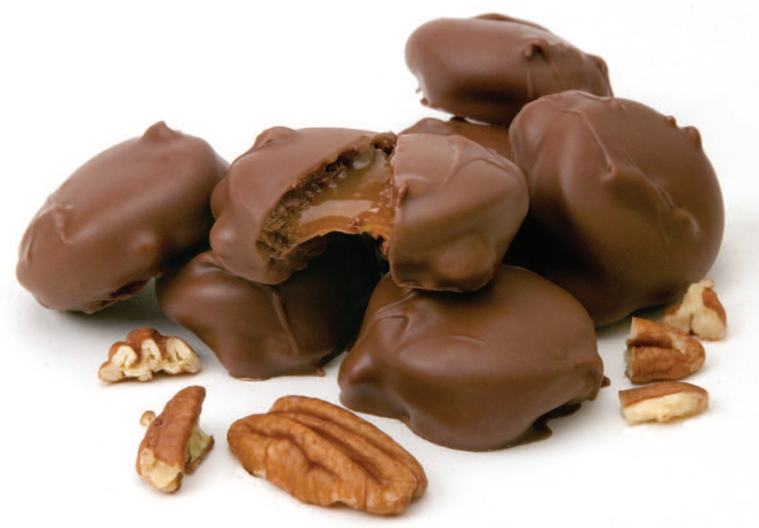
A mouth-watering selection of gourmet chocolates.