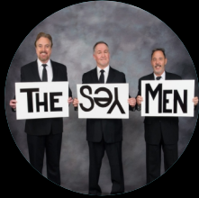
The Yes Men