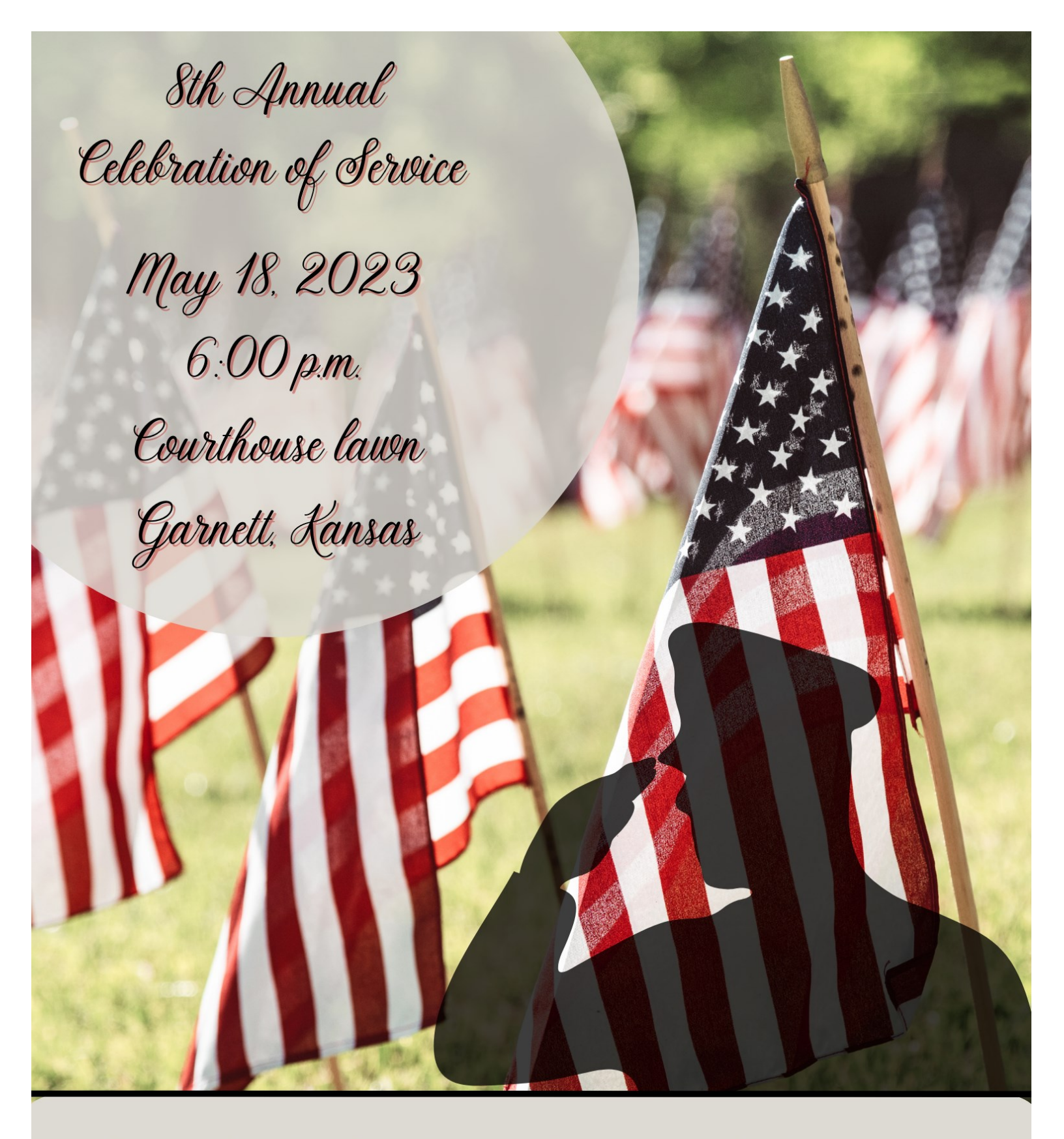
Land of the free, home of the brave.