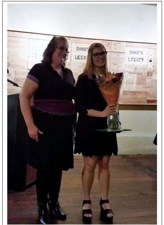
AREA 4 Workshop Participants ←