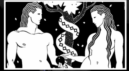
The Seed s of the Woman & Serpent GARDEN OF EDEN