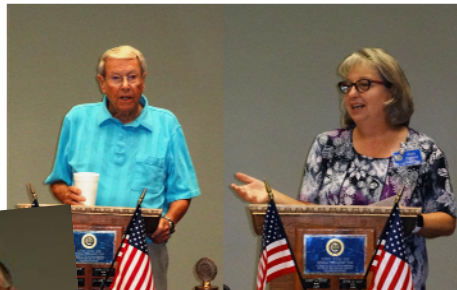
Golf Tournament Planning