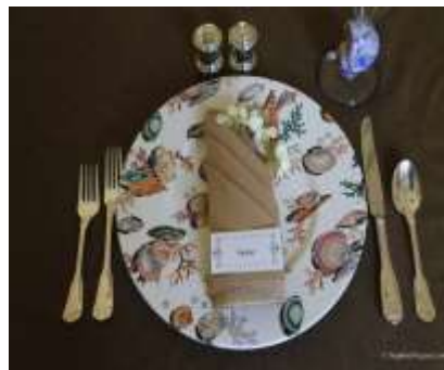
Napkin Folding: Three-Stripe Fold