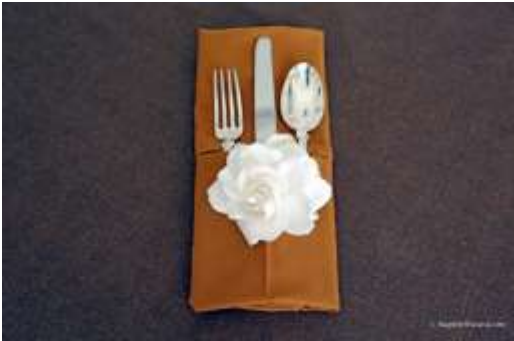
Napkin Folding: in Style Buffet