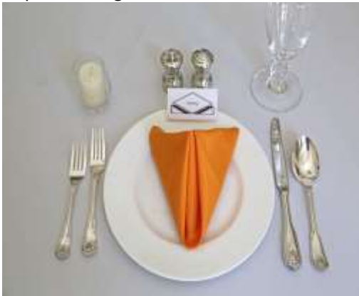
Napkin Folding: In House Fold