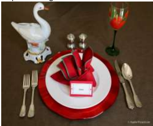
Napkin Folding: Bird of Paradise