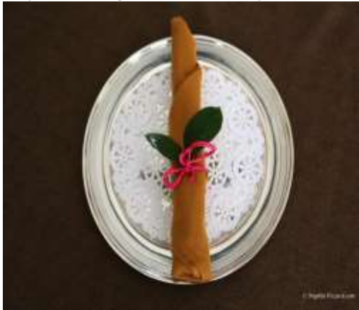
Napkin Folding: The Buffet Wrap