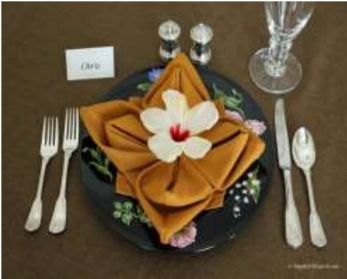
Napkin Folding: Flower in Bloom