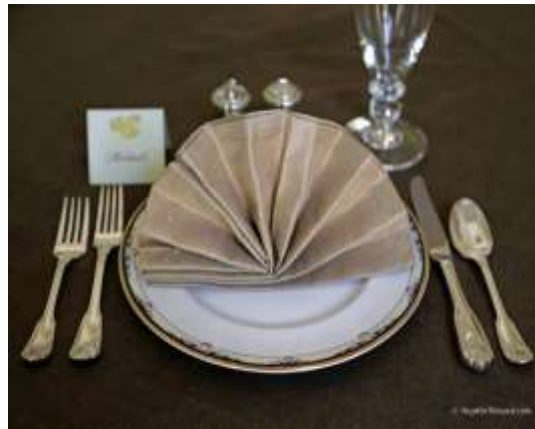
Napkin Folding: Splendid Fan