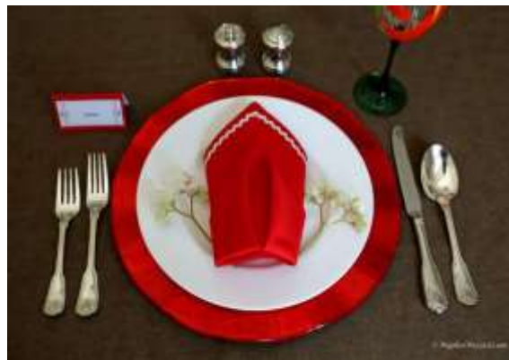
Napkin Folding: Orient Express