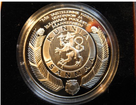
We fight for home, religion and homeland. Honour and Fatherland.

Many officers of Red Army could not find ways to defend and help their troops and much of the equipment was left behind and the Finnish Army collected the same. Artillery, rifles, machine guns and tanks.