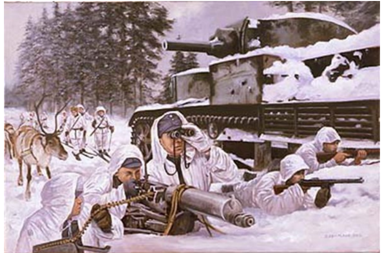
Winter War 1939 between Finland and Soviet Union

We're on the Web! www.ffsuomi.com ffsuomi@gmail.com