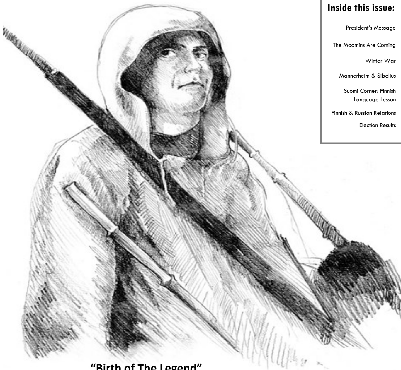
"Birth of The Legend"