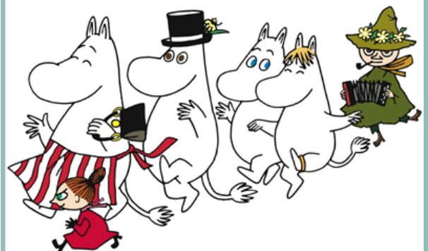
Little My, Muumimamma, Muumipappa, Muumitroll, Snork Maiden & Snufkin

In honor of Finland's Independence Day, Village Books will host a story time featuring Tove Jansson's lovable Moomins of Moomin Valley. Join us to celebrate at 2PM-3PM on Saturday, December 6 at Village Books, 1200 11 th Street, Bellingham. There will be art projects for children of all ages by FFSC artists. For more information, please call (360) 392-2665.