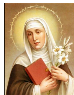
Feast Day: April 29

Acts 10:25-48 1 John 4:7-10 John 15:9-17