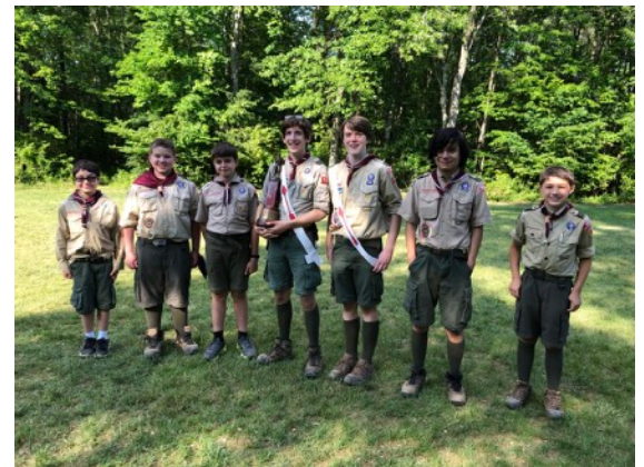
Field Day winner 2021 Rattlesnake