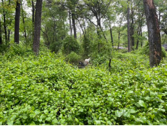
Site for the new shower house before the goats cleared it.

The camp is clearing the greenbriar from the proposed area with a team of goats hired for that purpose.