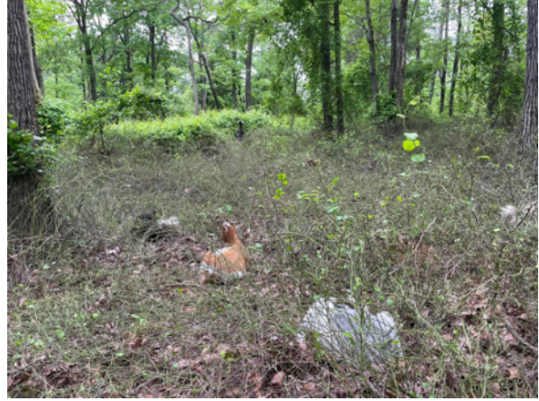
Site after the goats did their work. A goat with nothing left to do.