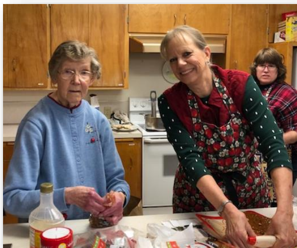
Bethany Connect Ladies