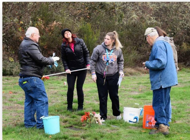
Cemetery clean-up volunteers

https://billiongraves.com/cemetery/Bethany-Lutheran-Cemetery/159373 .