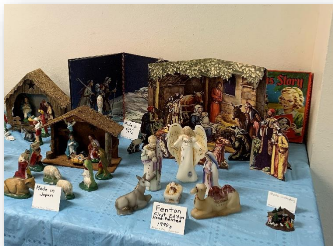
Festival of the Nativity