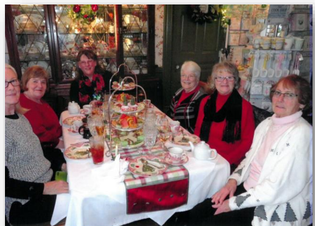
Bible Study Ladies having "High Tea" in Sumner