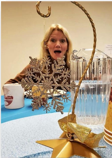
January Senior Social