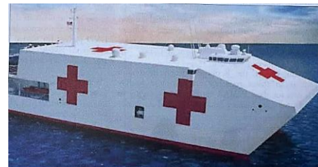
An artist's rendering of a Bethesda-class expeditionary medical ship. (Courtesy illustration by Austral USA).

From The Office of the Secretary of the Navy: