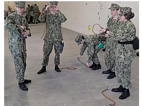
Cadets practice their last minute prep before knot-tying competition.