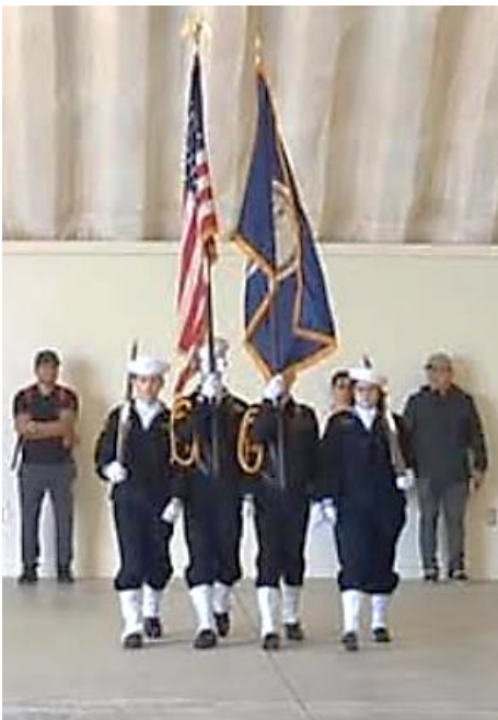
Bravo Zulu to the Color Guard for taking First Place in the competition!