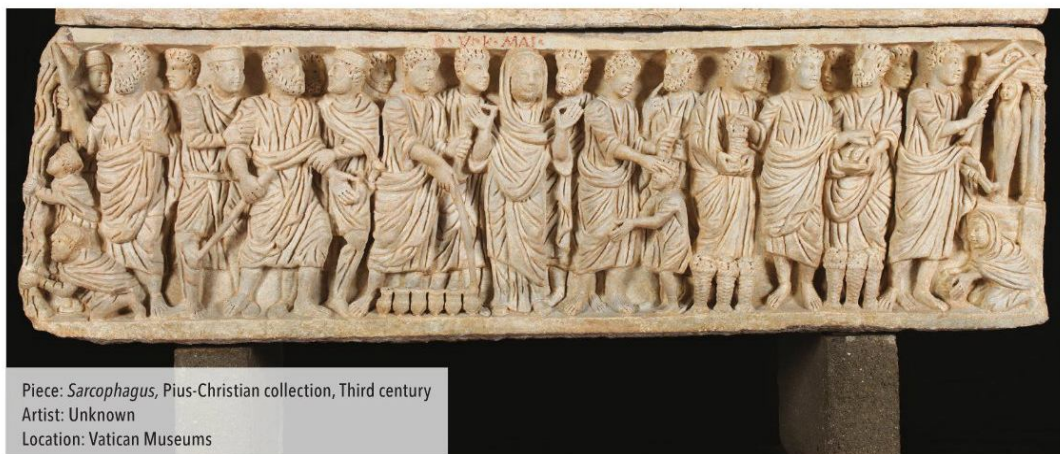
Piece: Sarcophagus, Pius-Christian collection, Third century Artist: Unknown Location: Vatican Museums

Am I generous with my time, treasure, and talent? Do I multiply what I have by giving it to God and others, allowing him to return it to me twelvefold?