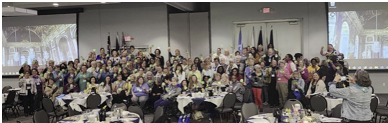
Participants on Friday night.