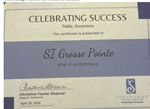
Celebrating Success for Public Awareness

Here are two more of the Celebrating Success recognitions our club received. At left is the one for Program and the one at right is for Public Awareness.