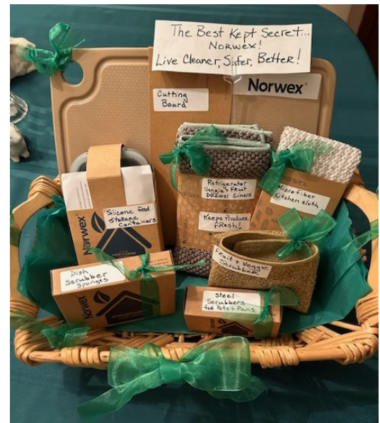
Here's the basket of Norwex cleaning products our club members put together to be raffled off at the conference.