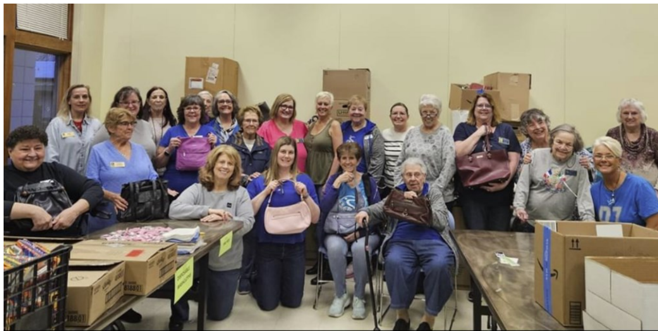
Pictured holding some of the purses are members representing Michigan clubs from SI of Flat Rock, Down River, Grosse Pointe, Macomb, and Trenton.