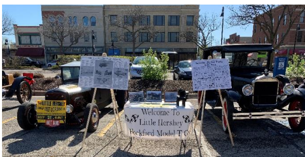
Promoting the club and Little Hershey