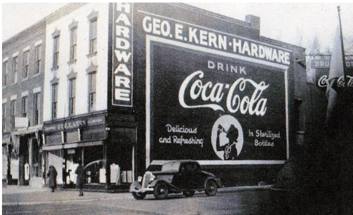
170 Main Street, George E. Kern Hardware

170 Main has also been home to Andersen Jewelers and in the most recent past, a dojo on the commercial level and residential space on the second and third floors.