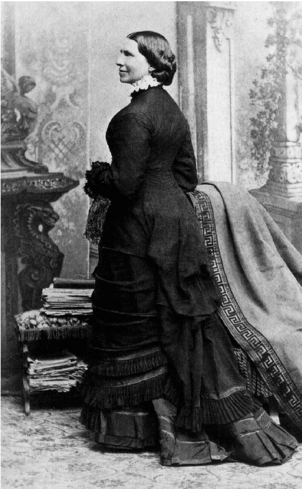
Clara Barton as she looked when the Dansville Red Cross Society was formed.