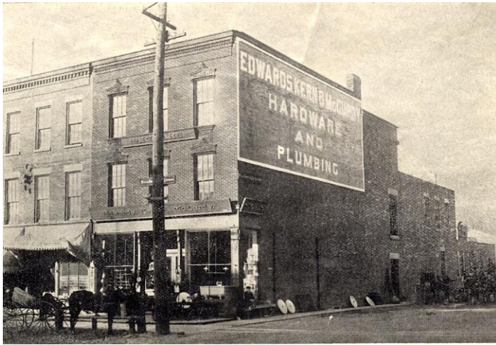
1875, 170 Main Street