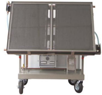
MODEL H-SST-1A Back view showing solar collector tilted toward sun

The Hampden Model H-SST-1A Solar System Trainer is an actual solar hot water heating system. System components include a solar collector, circulation pumps, storage tank, heat exchanger, air separator, air handler, solar heating coil, automatic air vents, thermostat, and a control panel with sensors. Gauges, thermometers, and flowmeters permit students to observe pressures, temperatures, and flow rate while the system is in operation. The trainer is mounted on a mobile frame and the collector panel is adjustable for easy positioning in direct sunlight. An electrical fault package option can be added, specify H-SST-1A-FP . A Computer Data Logging Option can be added, specify H-SST-1A-CDL .