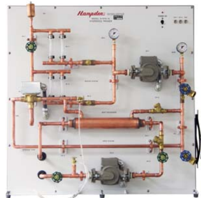
MODEL H-HYD-1A Dimensions: 36"H x 36"W x 13"D Shipping Weight: 290 lbs.