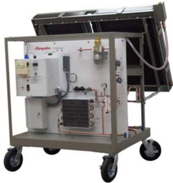
MODEL H-SST-1A Front view showing components Overall Dimensions: 72"H x 48"W x 34"D Shipping Weight: 450 lbs.