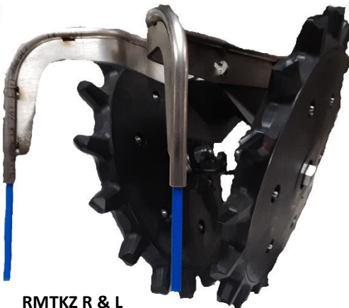
RMTKZ R & L