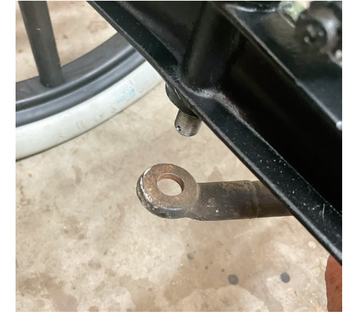
Perch end of radius rod showing round hole, not oblong

Using a support to lift and hold the radius rod up, attach each end of the radius rod to the spring perches, then place the perch nuts and tighten each securely. Fit the cotter pins to safely retain these nuts.