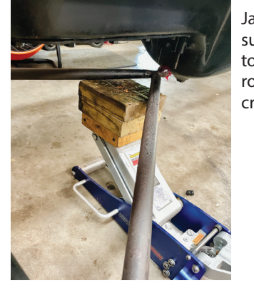
Jack with wood support used to lift the radius rod into the crankcase socket

Using a jack with support under the radius rod, apply copious grease to the ball end of the rod and the socket under the crankcase. Jack up the radius rod to secure the ball in the socket.