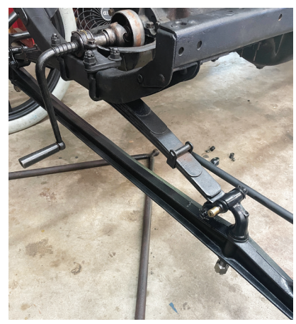
Chassis ready for installing the front axle radius rod

Check the condition of the radius rod for straightness, and that each perch end hole is not worn oblong for the tapered perch nut used from 1921-27. The ball end should be fully spherical, 1.250" (approximately 31.7 mm) diameter, without any egg-shaped wear.