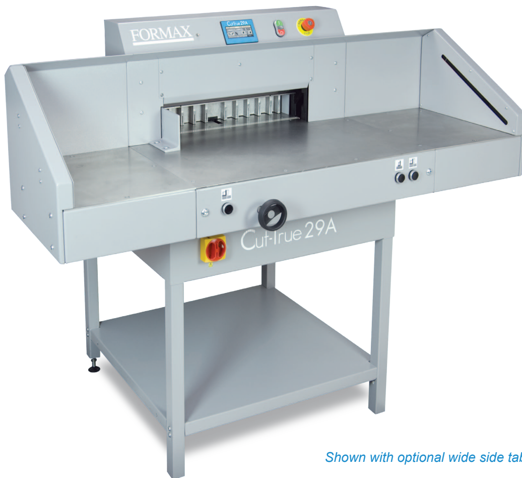
Shown with optional wide side tables

The Formax Cut-True 29A Electric Guillotine Paper Cutter offers precision cutting for paper stacks up to 20.5" wide. User-friendly, intuitive features include a touchscreen control panel, automatically-adjusting back gauge and the capacity to program up to 100 jobs/100 cuts . An infrared light beam safety curtain provides safety and convenience as it shuts down operation if the light plane is interrupted.