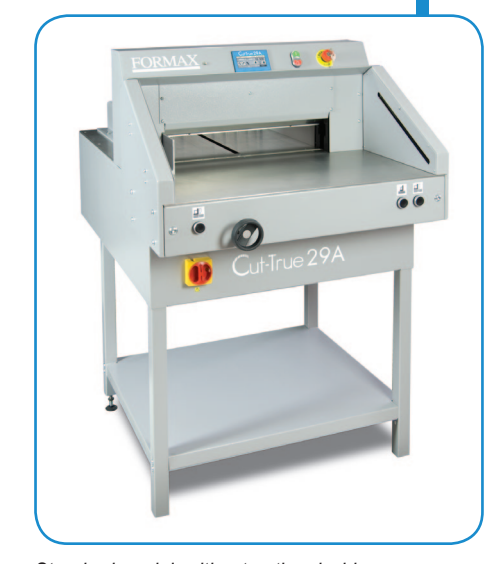
Standard model, without optional wide side tables

Formax - New Hampshire, USA www.formax.com