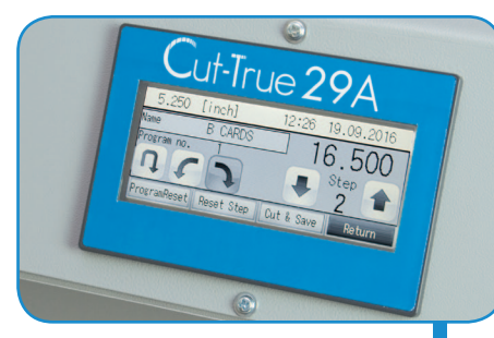
Touchscreen Control Panel allows for programming up to 100 jobs