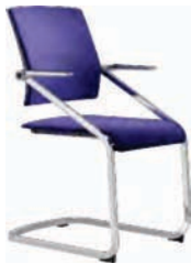
3102 A : 19” C : 19” E : 17”