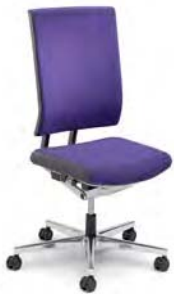
3001 A : 19” C : 18 - 23” E : 23”