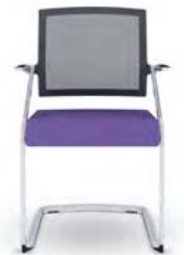
3104 A : 19” C : 19” E : 17”