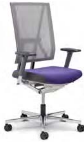
3005 A : 19” C : 18 - 23” E : 23”