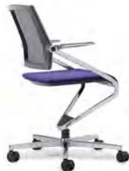
3007 A : 19” C : 19” E : 17”