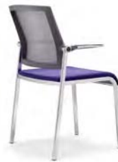
3103 A : 19” C : 19” E : 17”