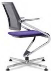
3006 A : 19” C : 19” E : 17”