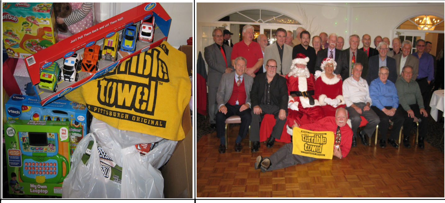
The Towel drops off its Toys for Tots contribution.