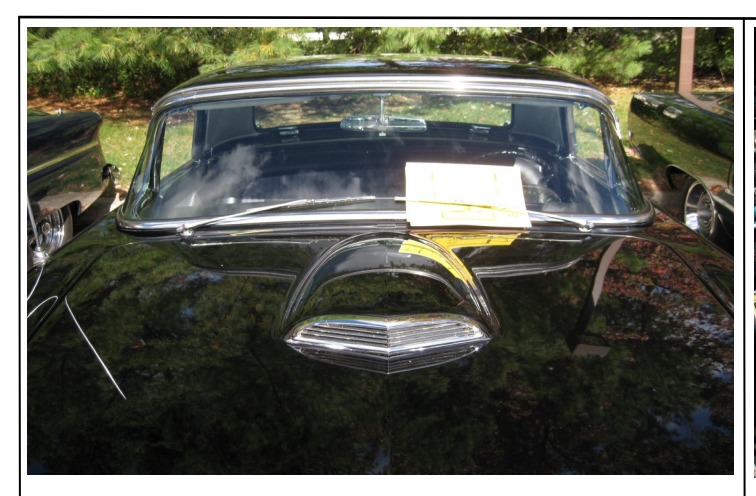
The Towel helped Carol and Charlie pick out this year's placard colors. Yellow and Black, what a surprise.