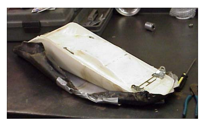
4. With all the staples out, peel the cover back