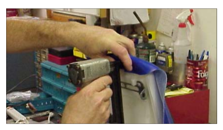
8. Elston puts in the first staple at the back of the seat.