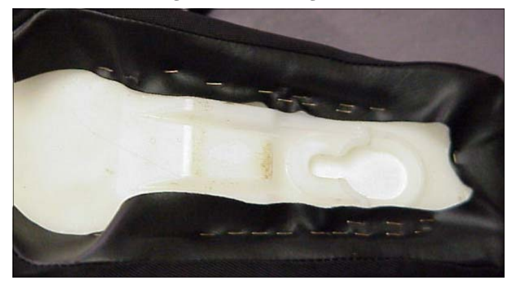
11. It's time to put some staples in the front of the seat. And continue filling in between the other staples.