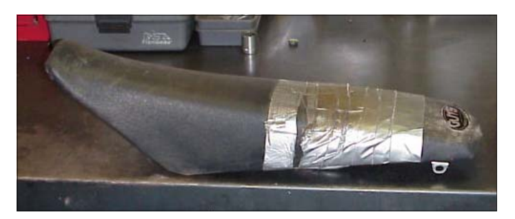
1. As you can see, due to a close encounter with the ground, I was in need of a new seat foam and a new seat cover.

So when I needed to replace my seat cover, I gave Elston a call and asked if I could bring my camera. Here's a step by step demonstration of putting on a new seat cover.