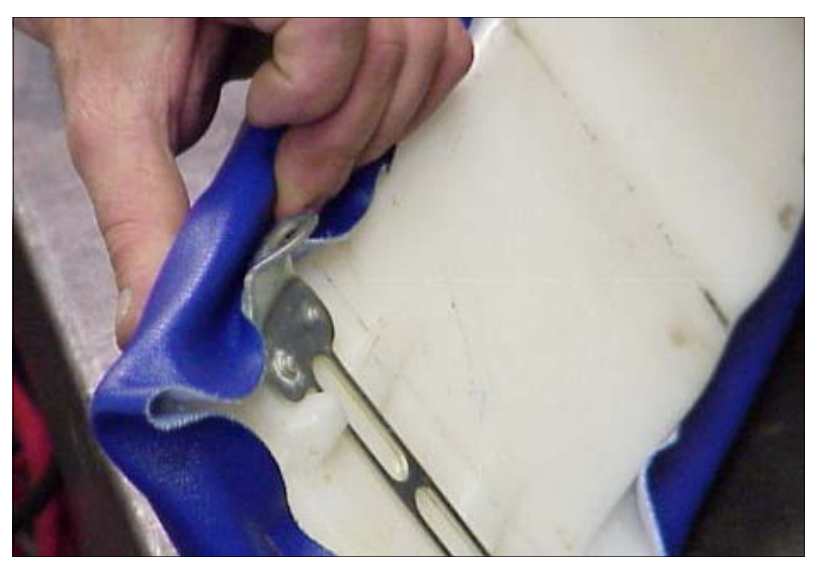
12. Work the cover in around the seat's mounting points.