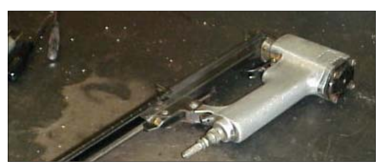
7. Here's the tool to use to staple the cover to the base. It's a pneumatic stapler. If you use an electric stapler or a regular hand stapler, expect to have to hammer them in.