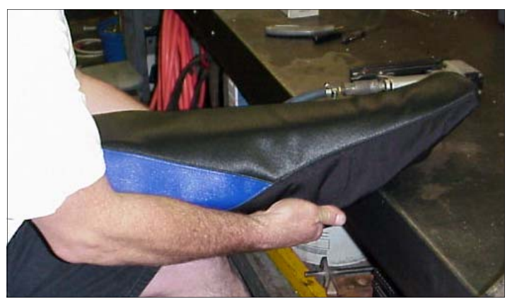
6. Now, you're ready for the seat cover. Start with the front of the seat and pull it tight to the back of the seat.