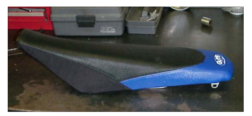
14. Here's the finished product.