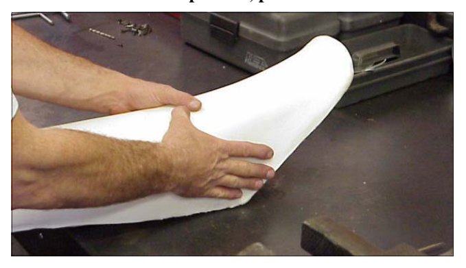
5. Next, put the new foam in place