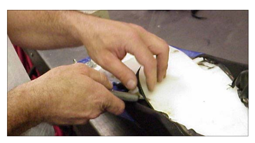
13. My WR has these mounting points in the middle of the seat. You need to trim around these.