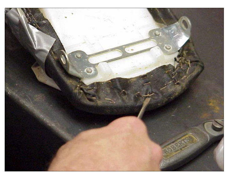
2. The first step is to remove the old seat cover. Here's Elston using a screw driver to pry the staples up.