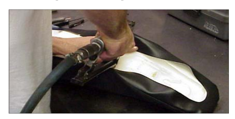
9. Then, skip round to the side of the seat at the bend. Put one in each side.