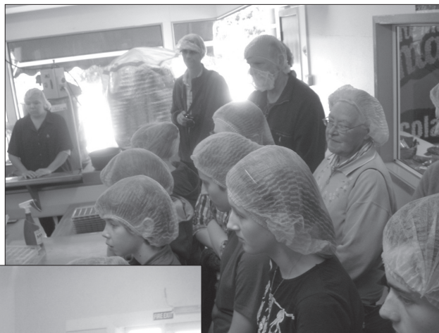
Above: At the chocolate factory, concentrating on the next bite!