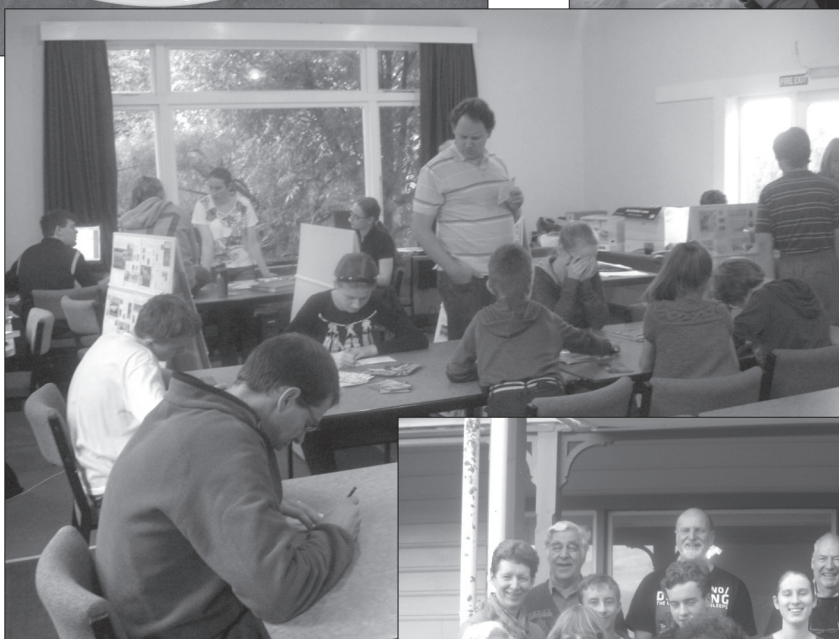
Left: Writing up Kiwi Postcards to be sent overseas