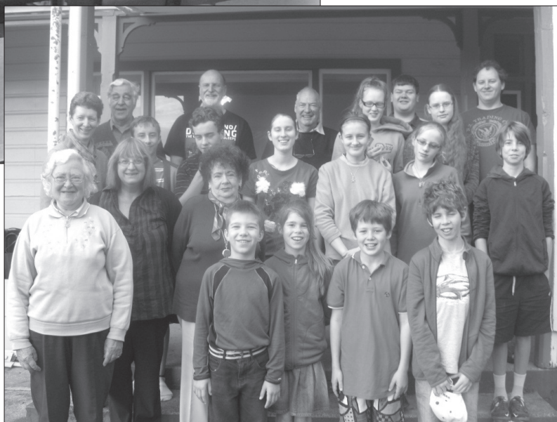
Above: Group photo of campers, leaders and helpers all with happy faces.

Overall there was a good spread of classes and sizes of exhibits this year. Across the children we had traditional (3), thematic (6) and open class (3).