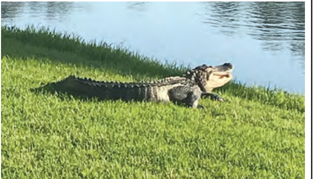
Near the 13th tee.

Do you have any pictures you would like to share? Post them in the Caught on Camera spot. Submit your photos, with a brief description, to newsletter@eagleridge33912.com.