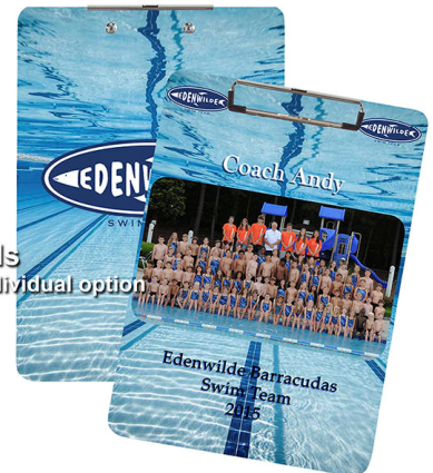
Clipboards Available in team and individual option