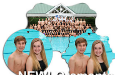
NEW! Ornaments Choose from 3 different designs