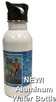
NEW! Aluminum Water Bottle