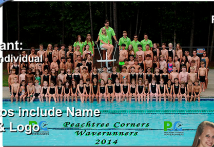
Team Photos include Name & Logo