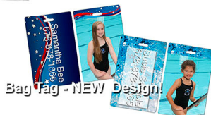
Bag Tag - NEW Design!