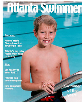
Swim Magazine Cover