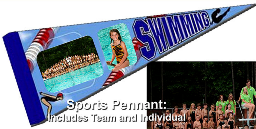
Sports Pennant: Includes Team and Individual

PhotoVentures Gives Swimmer and Parents One-Of-A-Kind Memories at Exceptional Values.