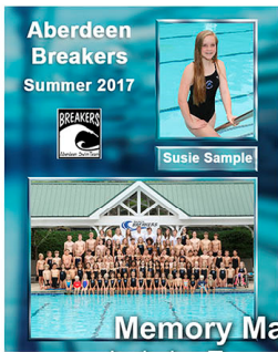
Memory Mate Includes Team and Individual images combined with Name and