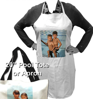
20" Pool Tote or Apron