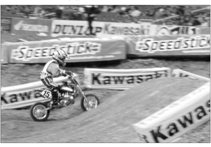
Those jumps look awful big, particularly on a bike with those little wheels.