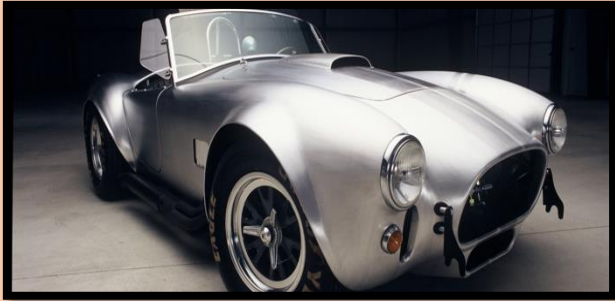
Brushed Aluminum 427 KMS/SC

If you ever wanted to own a 427 CI powered Shelby Cobra you will not want to miss this tour of the Kirkham Motorsports factory where they are producing Cobra replicas. This will be an overnigher, so sign-up now, book a motel room in the Provo area and mark your calendar for an exciting tour of a factory producing a replica of one of America's most iconic automobiles.