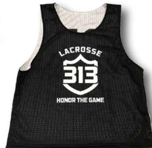
ELITE MESH PRACTICE PINNIES