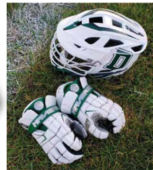
CUSTOM HELMETS AND GLOVES