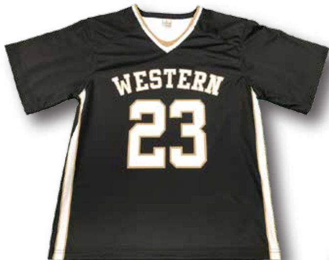
REPRO™ PREMIUM REPLICA JERSEYS