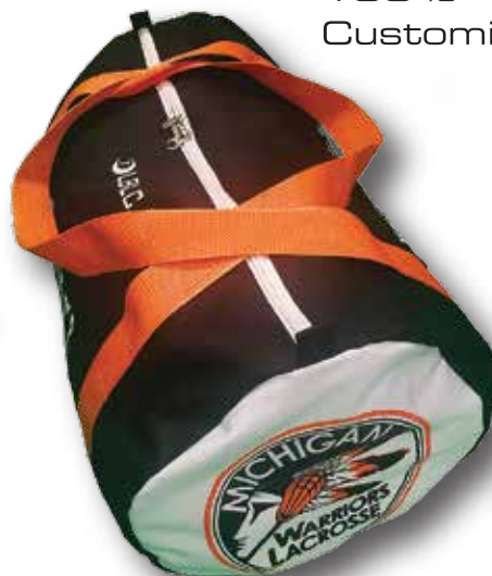
SUBLIMATED TEAM BAGS