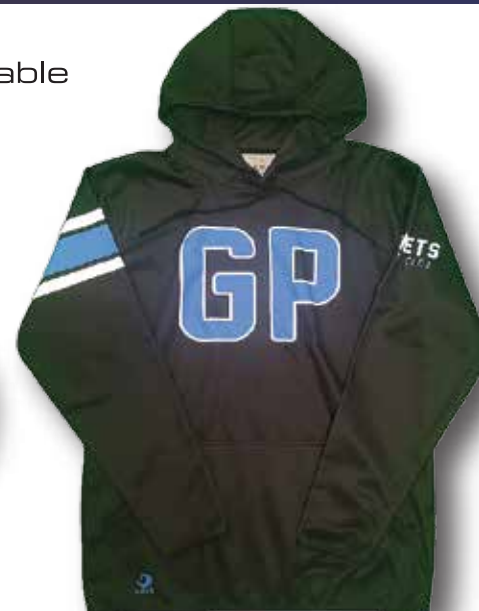
SUBLIMATED CUSTOM HOODIES