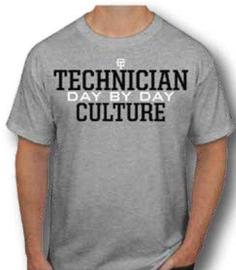
PRINTED TECH TEES