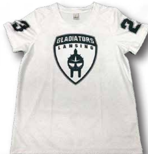
PRO LEAGUE GAME JERSEYS