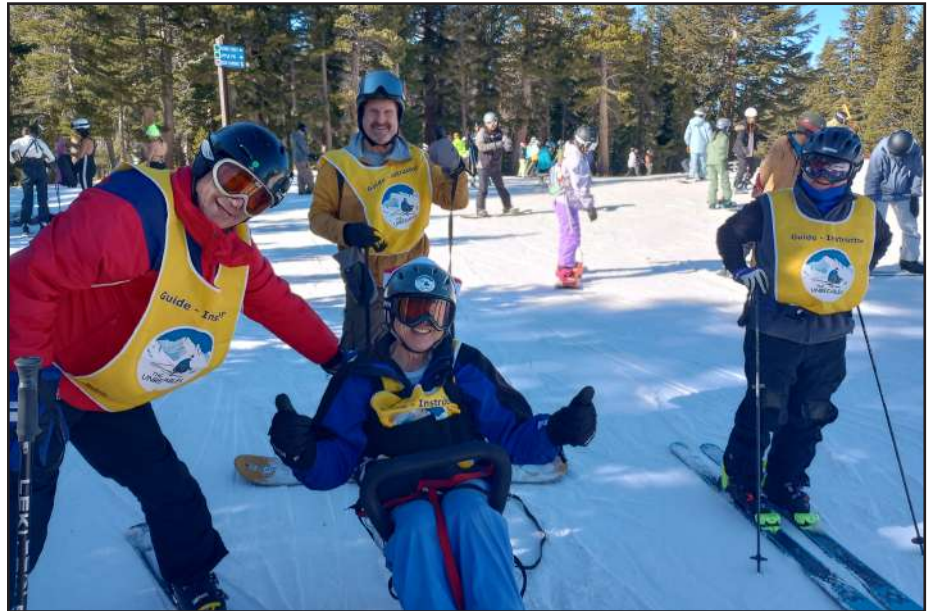
Kicking off the ski season in December at Mammoth.