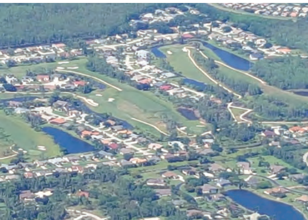
View of Eagle Ridge from plane taking off at RSW