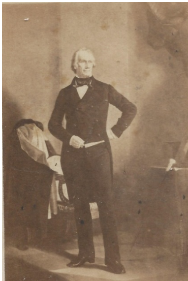
Henry Clay (1777-1852)

Ten months pass before the 16 th Congress is convened on December 6, 1819, and the Missouri question is again taken up in the House. During the hiatus, the issue has been debated across the north, south and west in local legislatures and assemblies.