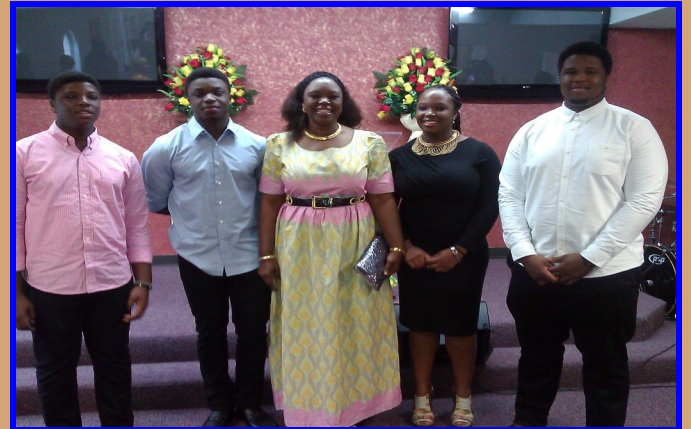
The Lawals Thanksgiving