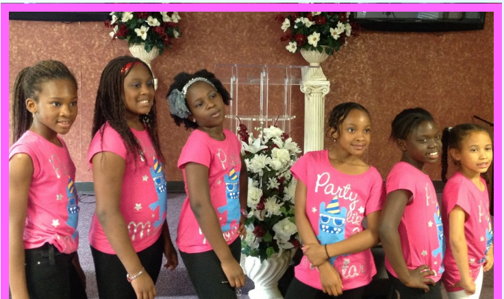
Mercy Girls Dancing Group