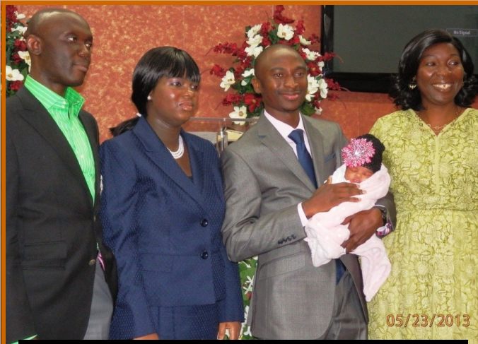
Naming of Baby Glory Eniyewu