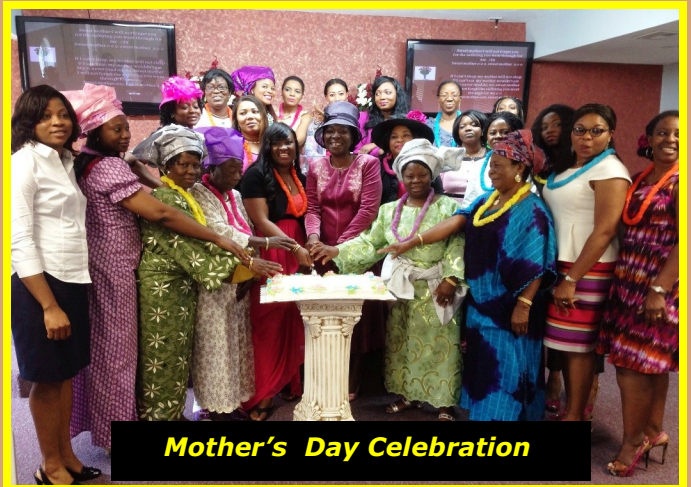
Mother's Day Celebration