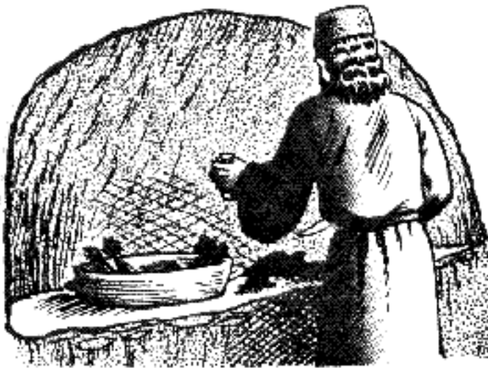
Above, the shelf-like niche "in use".