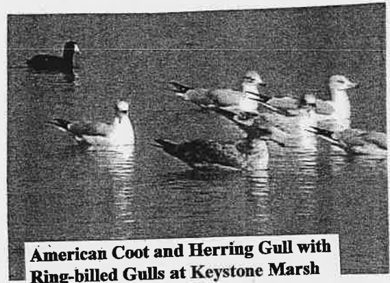
American Coot and Herring Gull with Ring-billed Gulls at Keystone Marsh