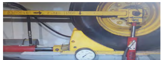
The Best Performing Chock Ever Tested