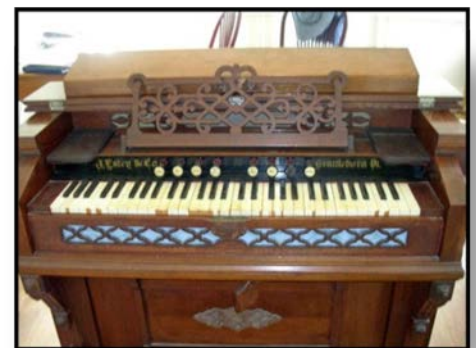
Esty Reed Organ