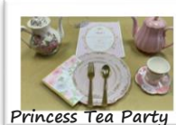
Princess Tea Party

Extra special souvenirs and decorations! See each flyer for more details and pick one to make your party extra special: