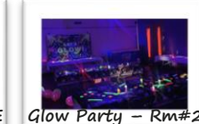
Glow Party – Rm#2